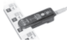
Label & Registration Detectors

UV Sensors Digital & Analog models up to 24 inch range